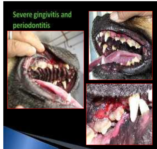
Fig. : 2