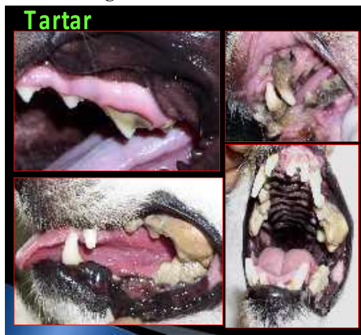
Fig. : 3