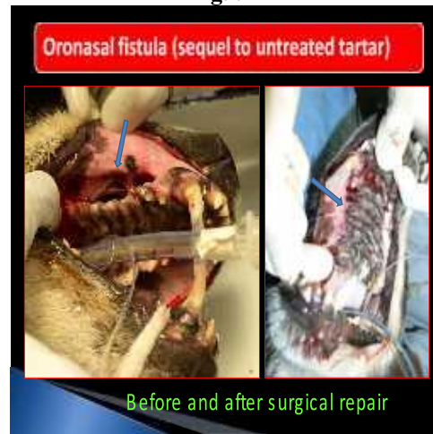
Fig. : 4

pain, profuse salivation, bleeding gums and intolerable halitosis, completely anorexic; severe dental tartar is present on teeth and characteristically mobility of teeth is seen in this condition. Tooth mobility is graded according to their direction: